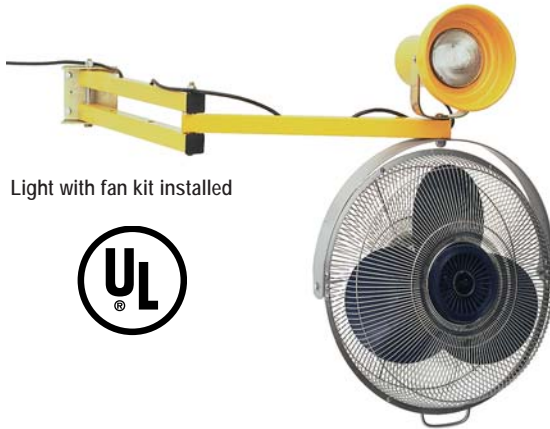
Light with fan kit installed