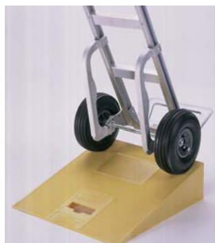
23.5" l. x 21.5" w. x 6" h.