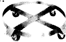
Figure 1 D5-SI

Wesco Industrial Products, Inc. P.O. Box 47 Lansdale, PA 19446 Tel: 215-699-7031 Fax: 215-699-3836