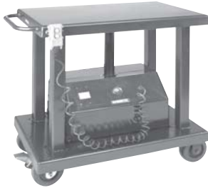
Figure 1 Model PLT-20-2436

Wesco Industrial Products, Inc. P.O. Box 47 Lansdale, PA 19446 Tel: 215-699-7031 Fax: 215-699-3836