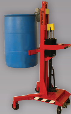
MADE IN U.S.A. High Reach Drum Handler - #240154