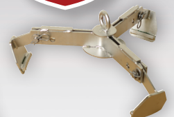
MADE IN U.S.A. Stainless Steel Universal Drum Lifter - #240063

See videos of these products on our website. www.wescomfg.com