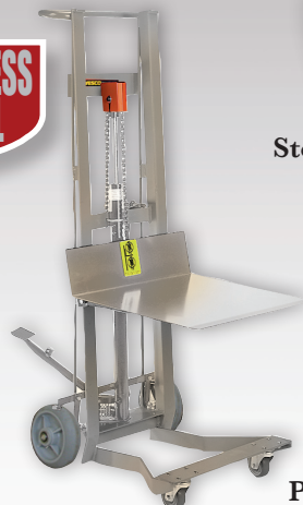
MADE IN U.S.A. Steel Universal Drum Lifter - #240062