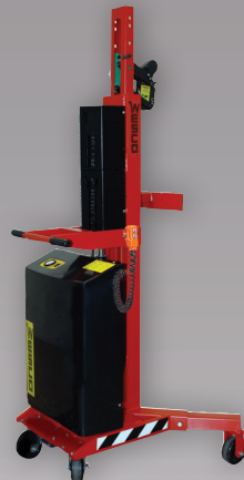
MADE IN U.S.A. Power Lift Drum Handler - #240156