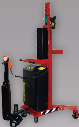
MADE IN U.S.A. Power Lift and Drive Drum Handler - #240157