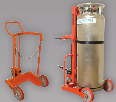
MADE IN U.S.A. Manual & Hydraulic Liquid Cylinder Lifts - #210131 (left) #240251 (right)