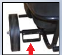
FORKLIFT POCKET (Forklift models only)