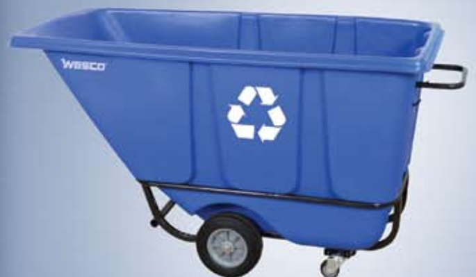
272577 Standard / Recycle